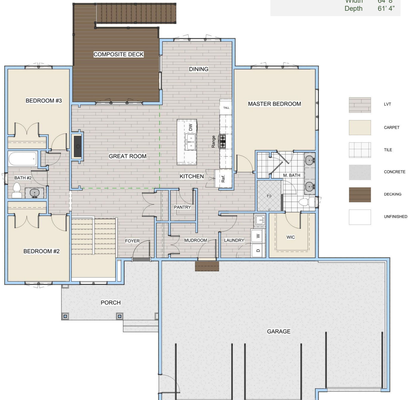
MAIN FLOOR LAYOUT (BASE)